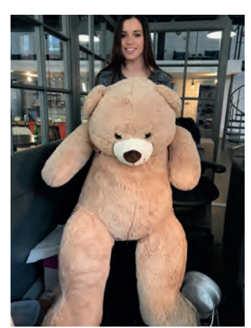
We sent small toy bags to Nairobi