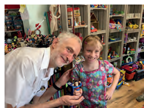
We held a FREE TOY day for teachers, parents and children to help themselves!